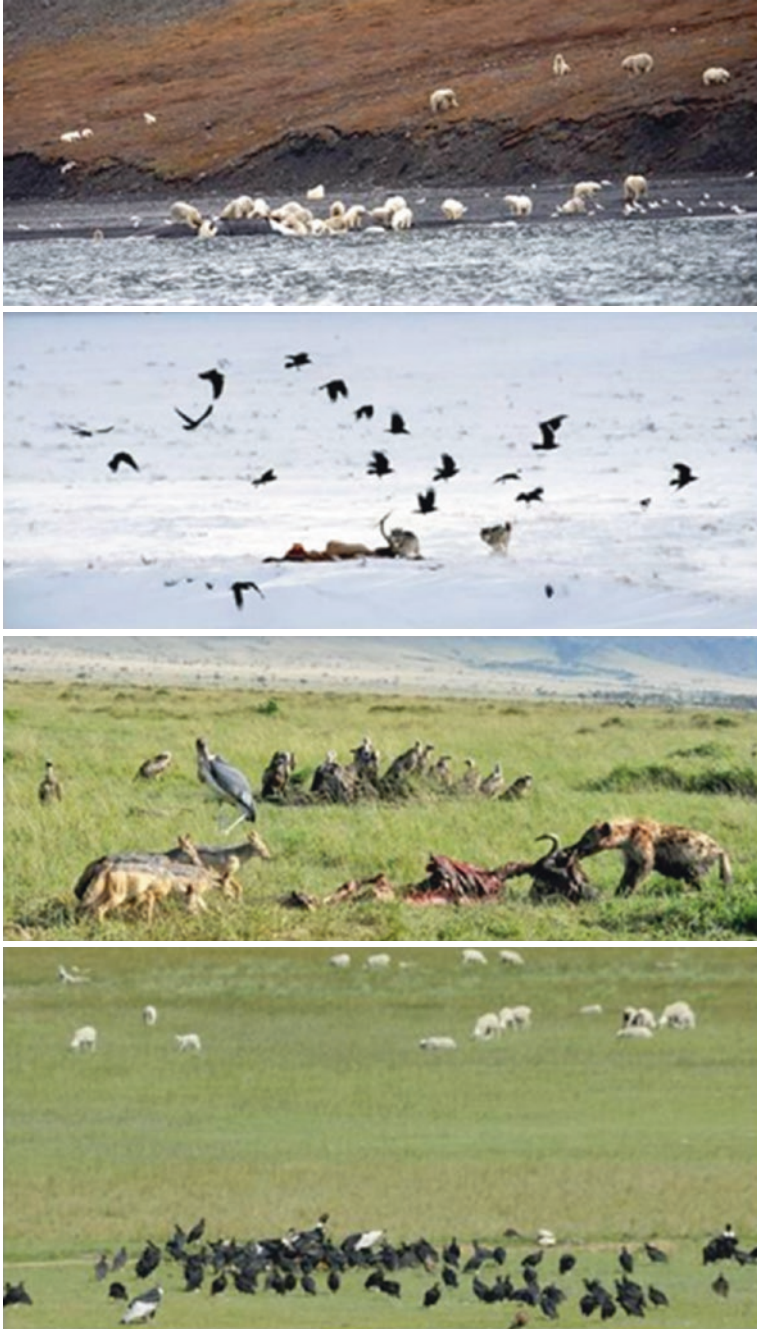
Fig. 1 Examples of scavengers in different ecosystems (from top to bottom): polar bears congregate at a whale carcass in the Arctic; wolves are often followed by raven flocks to feed on their kills; the scavenger community of the African savanna is one of the richest; condors and other vulture species rely often on livestock carcasses in Patagonian steppes