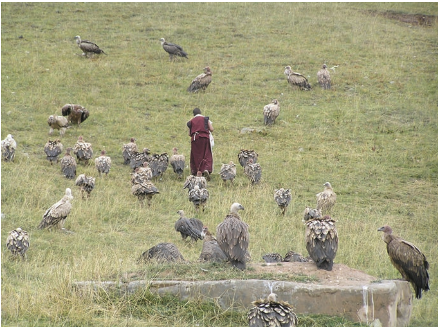
Fig. 3 Vultures in the Tibet feed on human corpses at the called “sky burials”.

In the Tibetan plateau, which is over 4000 m asl, vultures are the main scavengers and feed not only on wildlife and livestock carrion, but also on human corpses. A common cultural practice in this area are the sky burials. In this type of funeral the dead human body is placed on a platform on a mountain from where scavengers (mainly vultures) consume it. The remains are disposed for scavengers in as generous a way as possible (Fig. 3). The Himalayan griffon vulture Gyps himalayensis is the most common species at sky burials, and can be counted at hundreds in a single funeral; cinereous and bearded vultures are also observed at sky burials (MaMing et al. 2016). Tibetans believe that the cessation of breathing is only a first stage of death. Tibetan Buddhists view death as the journey from this life to the next one, and consider vultures as sacred animals aiding humans in this journey. This makes vultures highly important for both their environment and culture.