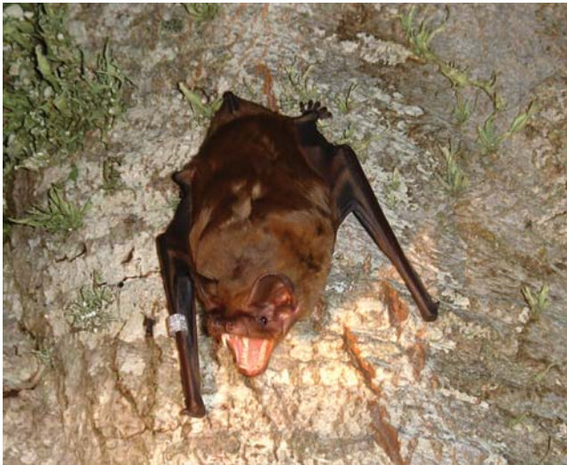
Figure 1. Nyctalus lasiopterus showing its impressive teeth to the researchers. doi:10.1371/journal.pone.0000205.g001

Accordingly, we explored seasonal variation of stable isotopes in the blood of Nyctalus lasiopterus and compared it with the isotopic signatures of its potential prey: insects and birds. We predicted that the temporal variability of stable isotope ratios would reflect an insect-based diet in summer, and incorporation of birds into the diet in spring and autumn during passerine migration, with a major contrast between summer, when diet is mostly based on insects, and autumn, when the mass occurrence of migratory songbirds