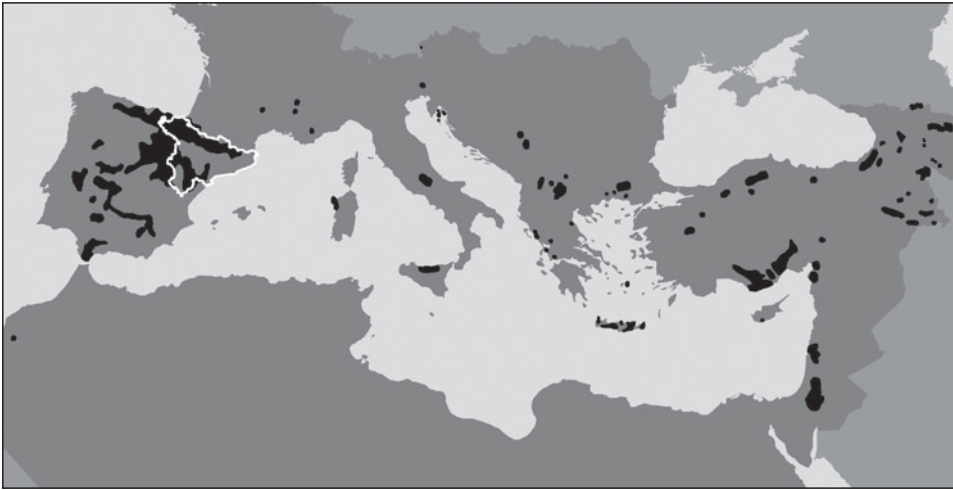
FIG. 1 Study area (encompassed by white line) and circum-Mediterranean distribution (shaded black) of the Eurasian griffon vulture Gyps fulvus population.